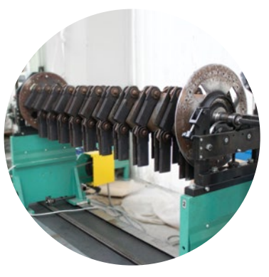
Straw knife drum