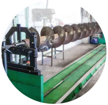
Augers different length